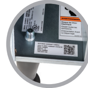
Unit specific QR code for quick access to service manuals, cleaning guides and warranty history