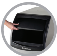
Ergonomic slide back door allows easy access to ice in the bin