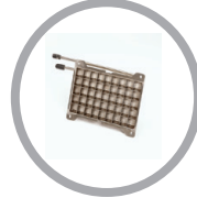
Clear Cube Evaporator Technology