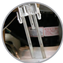
WaterSense Adaptive Purge Control