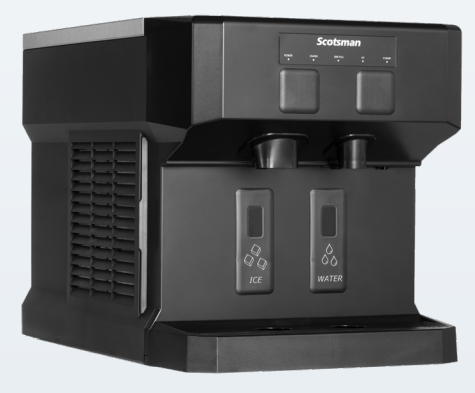
HID207 Compact Ice and Water Dispenser