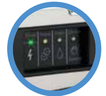
More Intuitive Indicator Lights