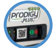
Convenient QR Code Placement