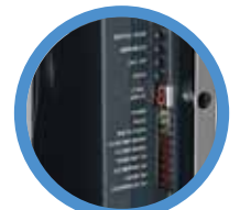
Internal LED Indicator Lights