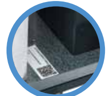
Convenient QR Code