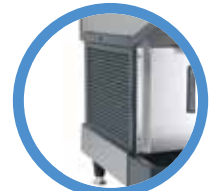
Unique External Air Filter