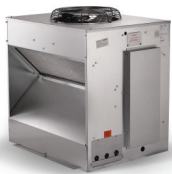
ECC1200 remote condensing unit