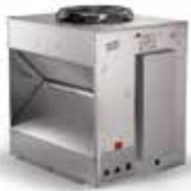
ECC1200 remote condensing unit