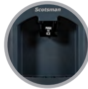
Standard Easy Push Chute