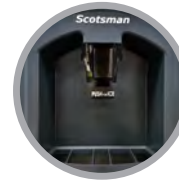
Optional Sanitary Lever Dispensing Kit Available (KHDSANLV)