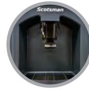
Optional Sanitary Lever Dispensing Kit Available (KHDSANLV)